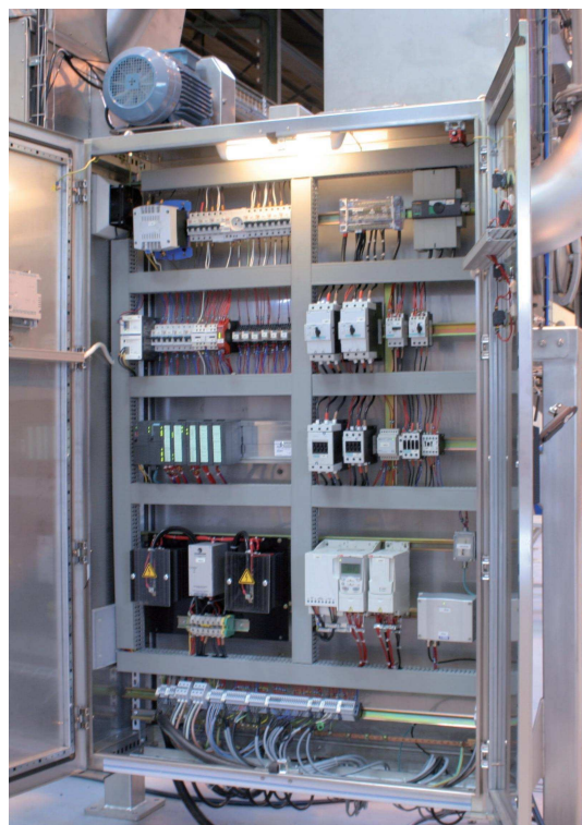
Electric cabinet for mixer