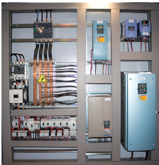
Electric cabinet for crushing line